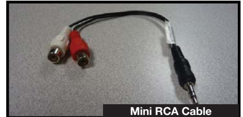
Mini RCA Cable